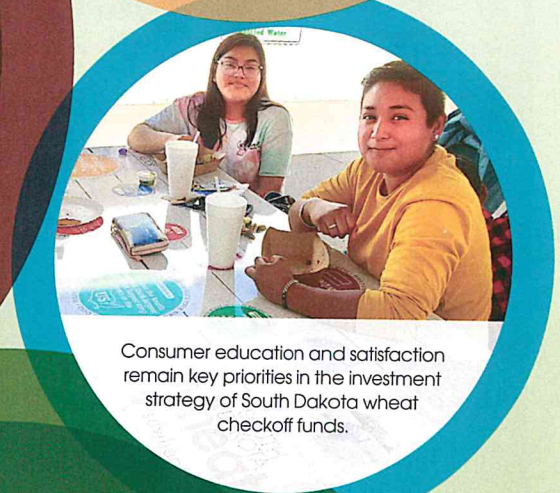
Consumer education and satisfaction remain key priorities in the investment strategy of South Dakota wheat checkoff funds.