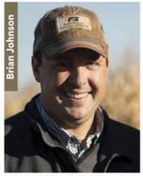
Green Up Your Soil and Wallet: How Diversity Pays... And Makes the Wife Happy