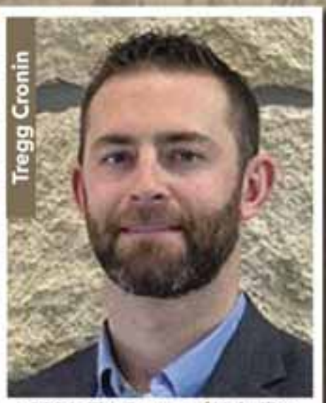
2021: The Return of Volatility and Uncertainty