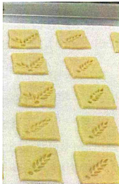
Fig 2. SD Wheat Commission logos imprinted on sugar cookie dough for use in Wheat Education Events (Wheat variety names could be emblazoned across the cookies as well (Hint! Hint!)).