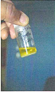
Fig 1. Wheat Bran Supercritical Fluid Extract showing lipid fraction. The composition of the bran affects the consumer appeal of whole grain bread.